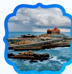
Vivekananda Memorial Rock